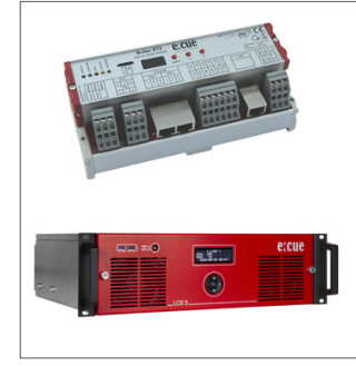
Butler XT2, Lighting Control Engine 3